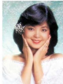
Teresa Teng 鄧麗君

At the height of the COVID-19 pandemic, difficulty in travel prolonged separation of families and friends. For our American Chinese immigrant VOV members, it meant multiple years missing journeys to those we loved in Hong Kong, Taiwan and China. We therefore bring you a suite of popular Chinese songs that hearkens to the music of our homelands. Taiwanese singer 鄧麗君 ( Teresa Teng ) was one of the most influential pop figures in the 20th century. She was immensely popular in Chinese communities around the world, as well as in Japan and Southeast Asia. The four songs in 鄧麗君組曲